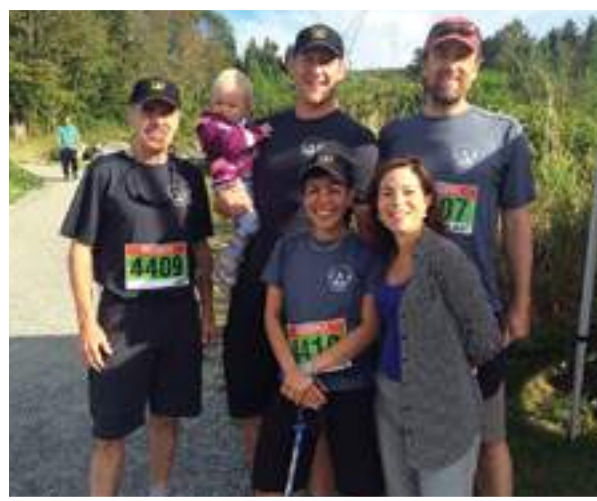
At the Coquitlam Crunch Challenge with Coquitlam Search and Rescue.