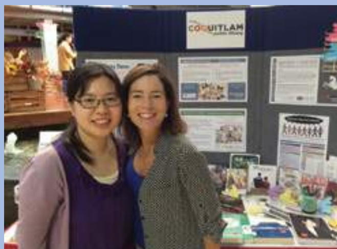
At the Coquitlam Public Library booth during the Mid-Autumn Festival at Henderson Place Mall.