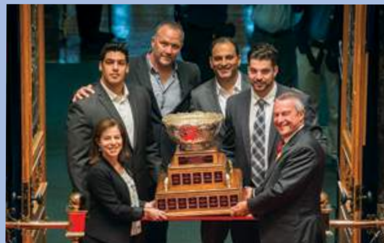
As the Opposition Spokesperson for Sport I joined with the Minister and the UBC Thunderbirds to present the Vanier Cup to the House.