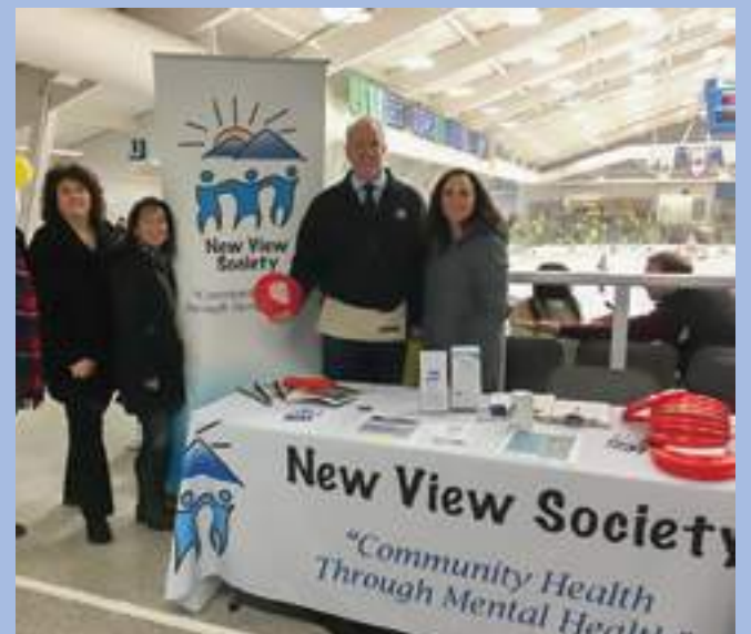
At the Coquitlam Express game with the Leader of the Official Opposition, John Horgan selling Frisbees for a fundraiser to benefit New View Society. (Right)