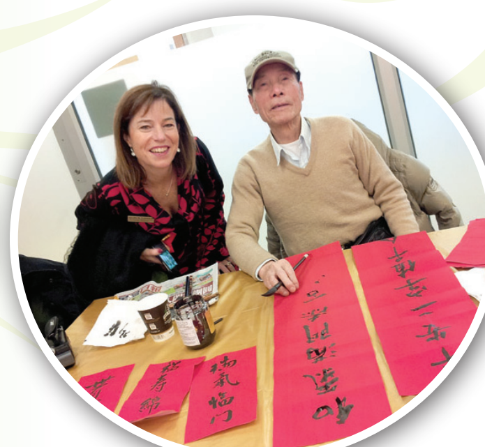
S.U.C.C.E.S.S. CHINESE NEW YEAR CELEBRATION JAN. 13, 2014