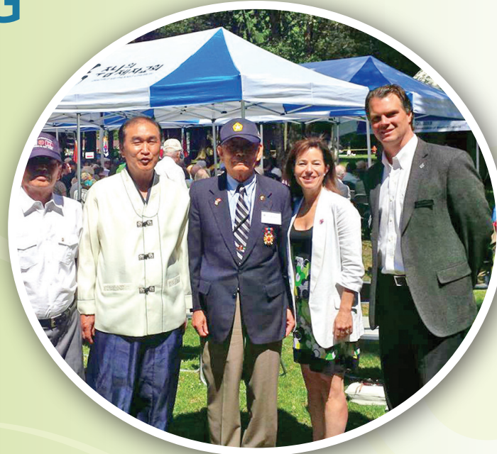
60TH ANNIVERSARY OF THE KOREAN WAR ARMISTICE JULY 20, 2013