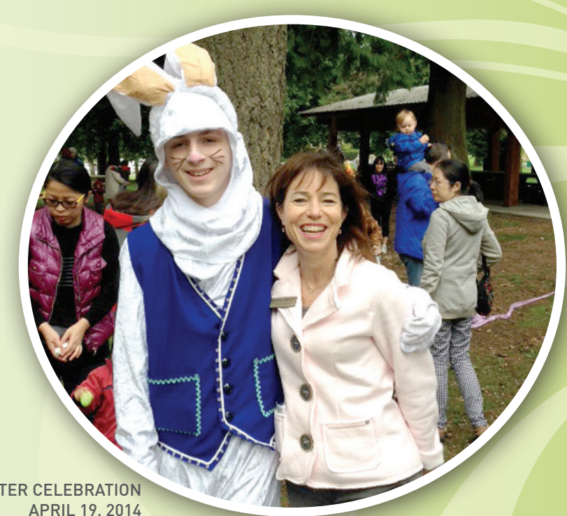
EASTER CELEBRATION APRIL 19, 2014

Debate of Private Members' Motion— Clinic for Late Effects of Childhood Cancer Treatment Monday, March 3, 2014