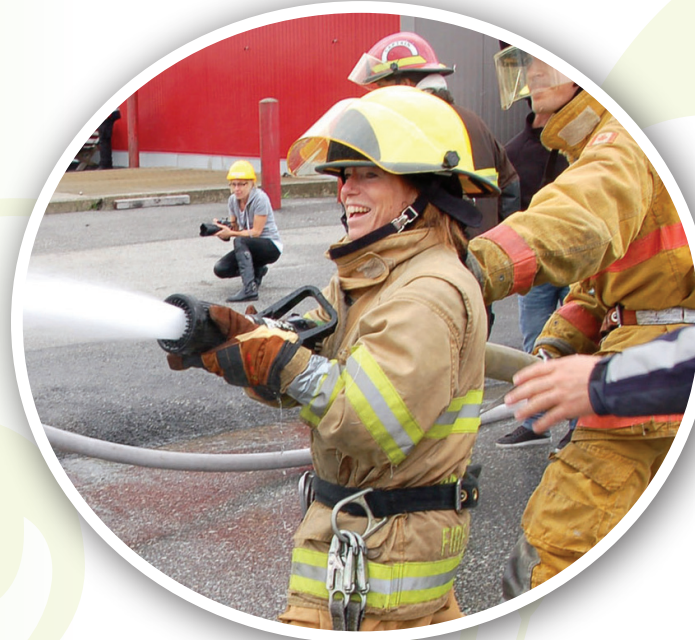
APPRECIATING THE FIRE FIGHTING EXPERIENCE AT FIRE OPS 101, SEPT 16, 2013

I think you need to put your money where your mouth is. I think we ought to be buying local, particularly for our publicly funded institutions. Those are taxpayer dollars that will stay in our communities and help our communities grow and do the things that we think they need to do at a local level.