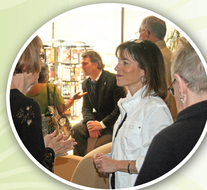
SENIORS TOWN HALL WITH MP FIN DONNELLY, APRIL 4, 2014

Monday, July 15, 2013 Debate of Private Members' Motion -Promotion of Purchasing from BC Businesses